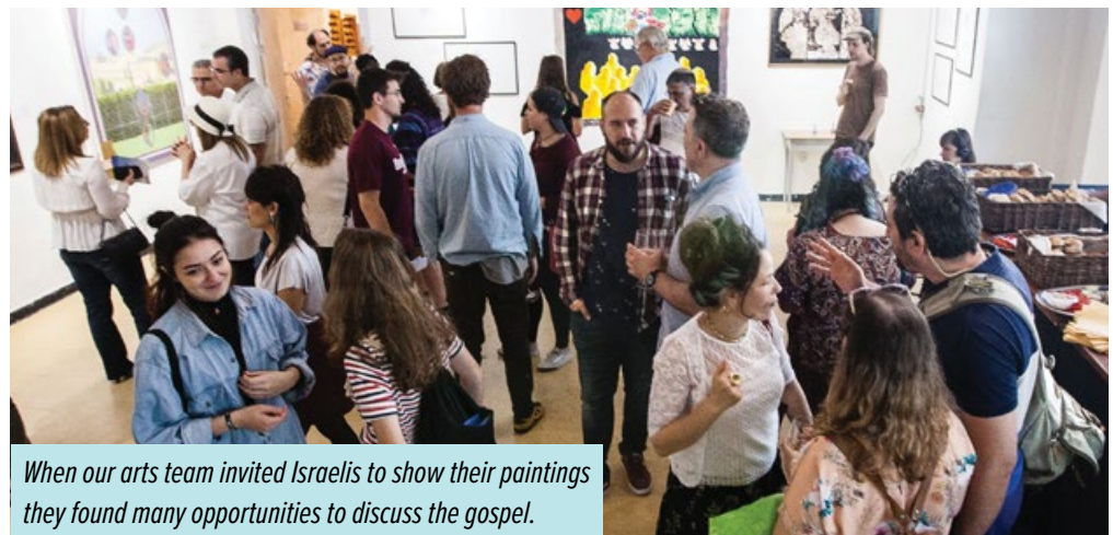
When our arts team invited Israelis to show their paintings they found many opportunities to discuss the gospel.